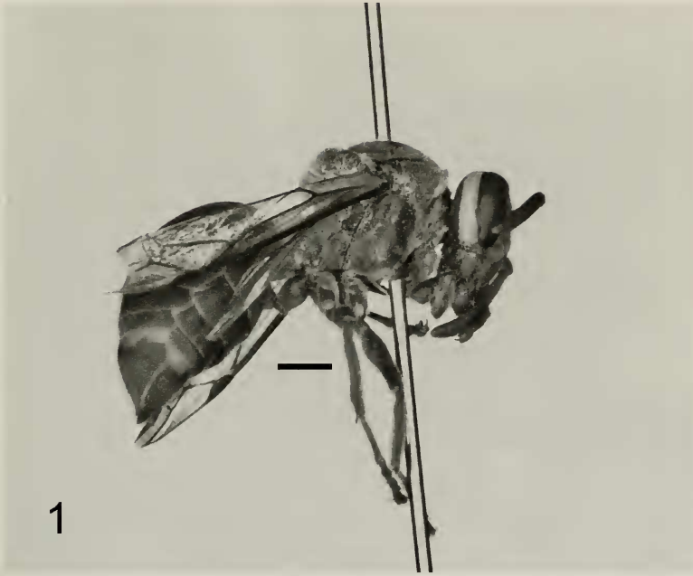
Figs 1–8. Chartergellus golfitensis West-Eberhard new species. Holotype. 1. Habitus. Lateral view. 2. Dorsal view. 3. Head, frontal view. 4. Head, lateral view. 5. Head, dorsal view. 6. Mesosoma, dorsal view. 7. Mesosoma, lateral view. 8. Scutellum, metanotum and propodeum, dorsal view. Scale bars = 1 mm.

an occipital carina, the mesepisternum lacking a dorsal groove, and the metanotum rounded (Carpenter 2004).